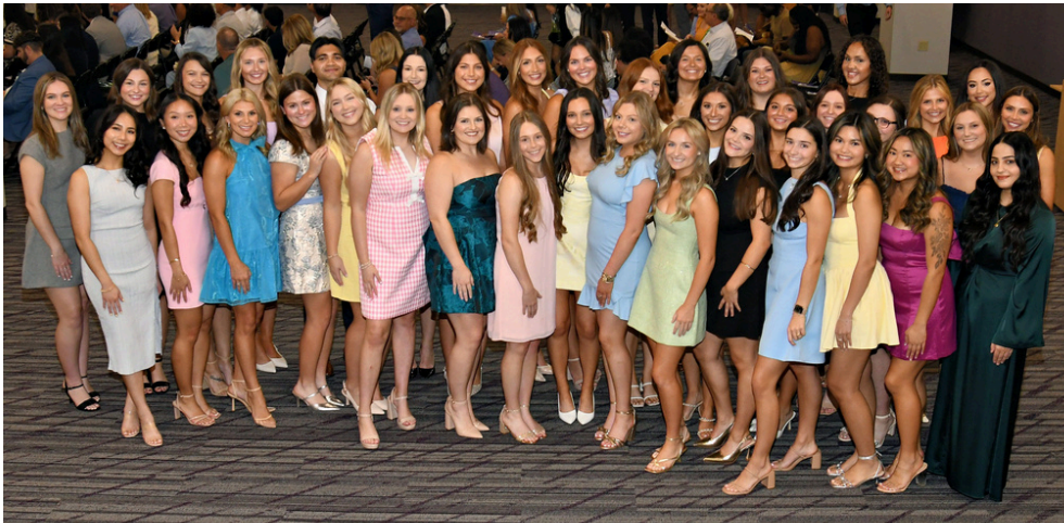
Dental Hygiene Class of 2026