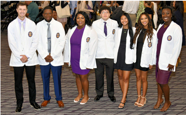
Dental Laboratory Technology Class of 2026