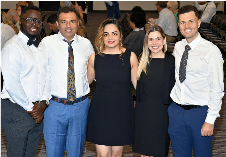
Internationally Educated Dentist Program Doctor of Dental Surgery Class of 2027