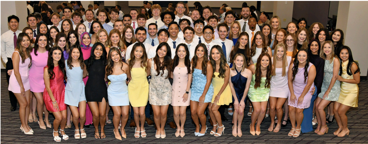
Doctor of Dental Surgery Class of 2028